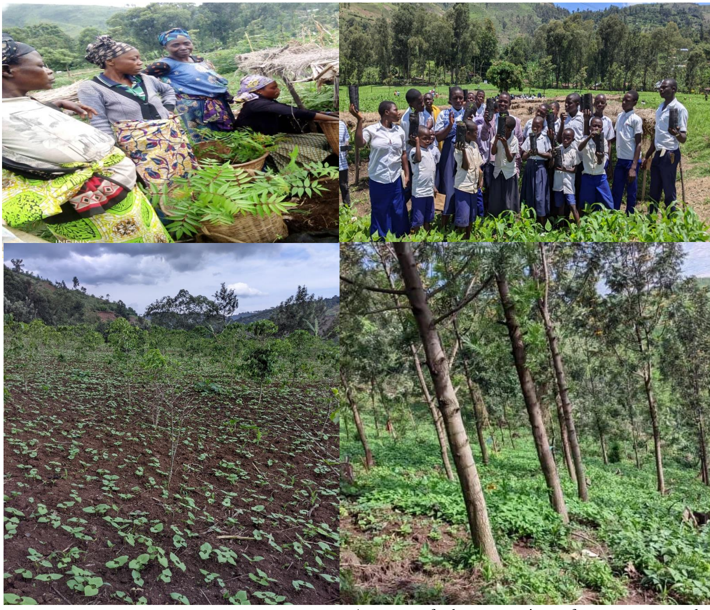
As part of the restoration of ecosystems and

landscapes, ALV carried out the following activities: Installation of agroforestry and fruit nurseries in the territories of Kabare, Kalehe, Walungu and Uvira.