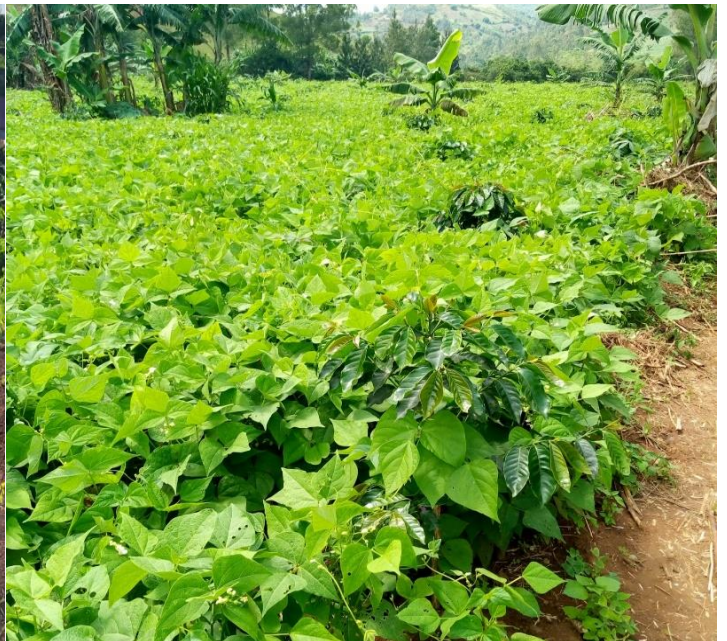
Integration into food crop fields