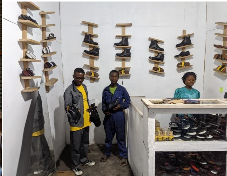
Shoemaking and leather goods

For this work of equipping the centers, Action Le Vert needs second-hand machines for cutting and sewing, carpentry, masonry, plumbing and electricity, IT, automotive mechanics, mixed hairdressing and beauty salon and other trades. It asks legal entities or individuals who have second-hand machines to give them to us in terms of donations to support and facilitate the learning of learners.