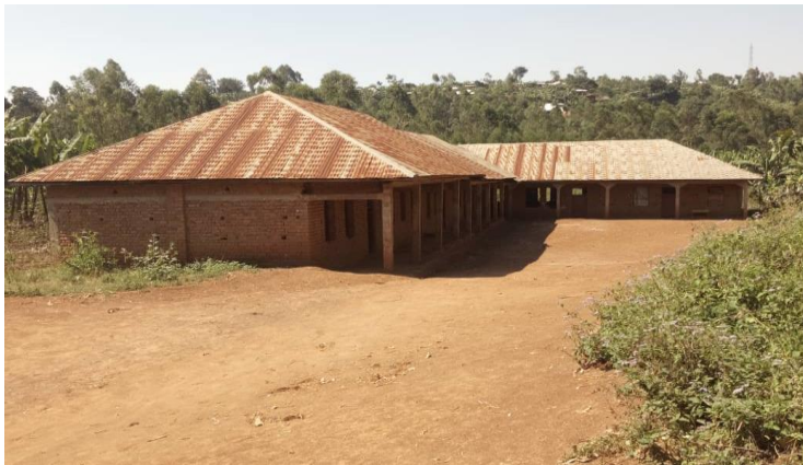
CREAM KASIHE / KABARE