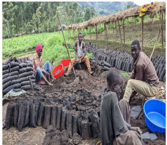
Filling the bags