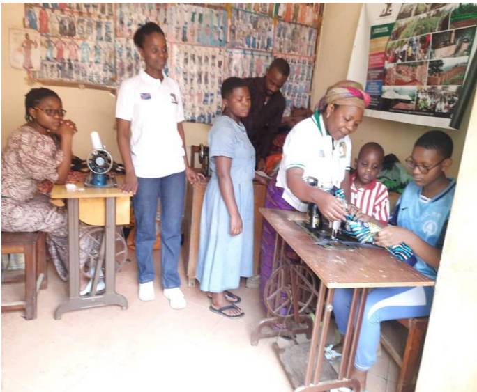
Cutting and sewing