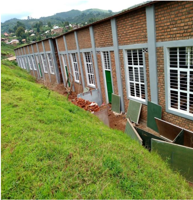
CREAM BAGIRA / CIRIRI