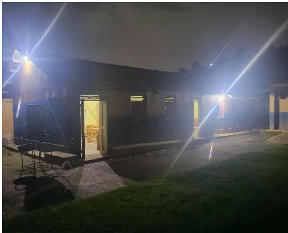
Muko High School Solar Project

Midland Rotary continues to support Agape Community Transformation for humanitarian service in Uganda; specifically, education, a new science lab, and social entrepreneurship.